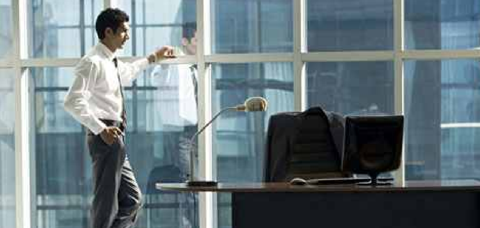
Plate Glass Insurance Policy

A positive image creates a lasting impression